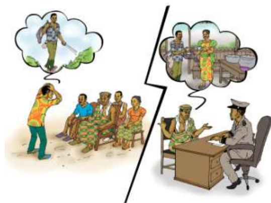
Figure 2. Example of advice on Ebola from a WHO/UNICEF/ONUICI picture book. 24

In addition to incorrect information, negative messages are also being disseminated. The USAID picture book encourages communities to report any newcomers to the authorities. The WHO, UNICEF and ONUCI picture book includes a series of images showing a man denouncing a hunter to the police, with the caption ‘I should report all preventive measure violations to the authorities’ ( figure 2 ). Even though both health workers and anthropologists have documented that stigmatization and coercion undermine efforts to control the disease, these books encourage a repressive management of the epidemic.